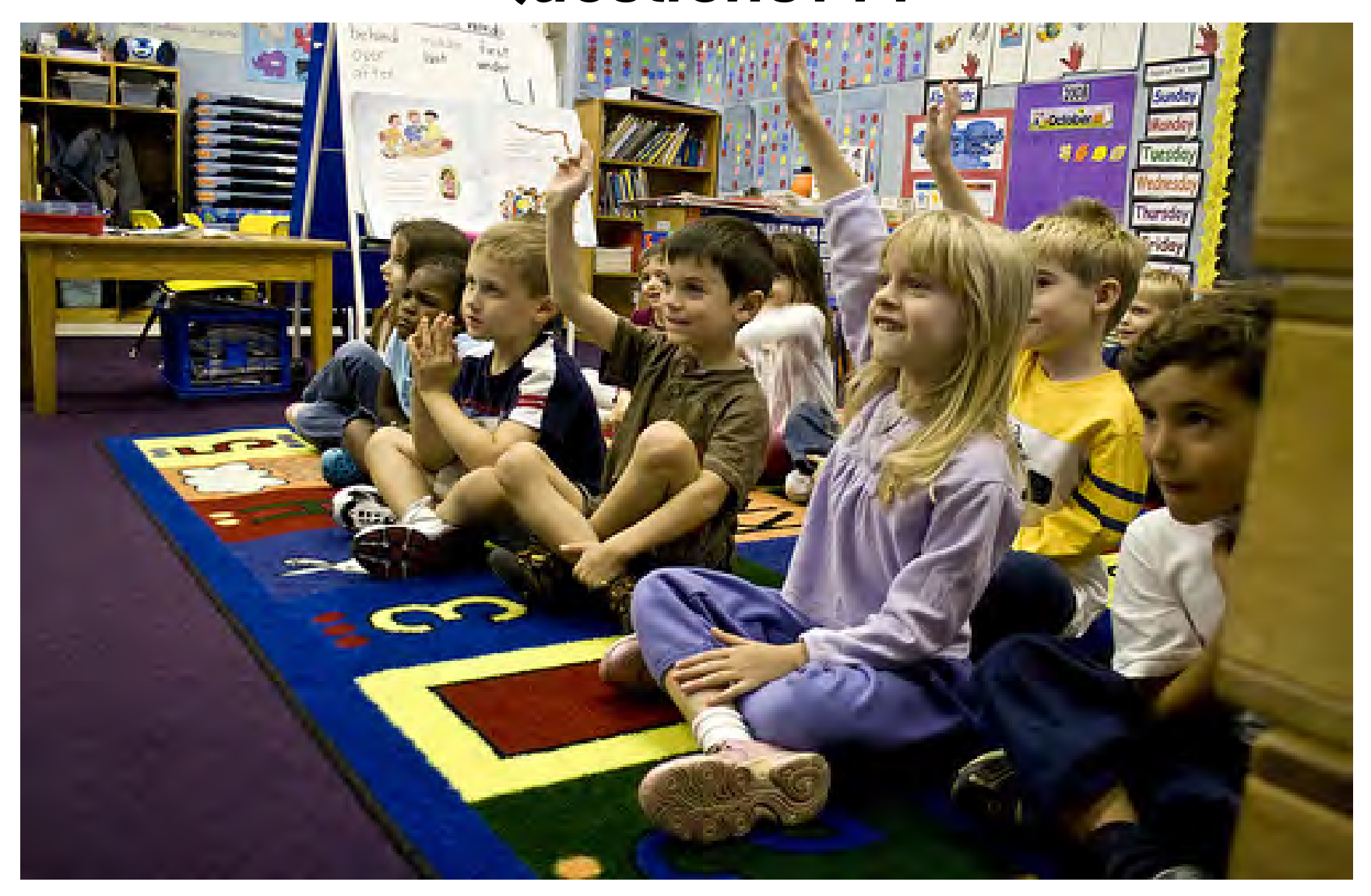
"It's All About The Students!"