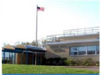
Middle Gate Elementary