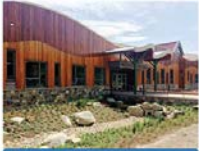
Sandy Hook Elementary