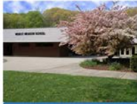
Head O'Meadow School